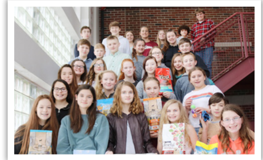
Pictured are members of the Sandy Creek National Junior Honor Society chapter with various items collected from a donation drive for Paws Across Oswego County.

The trio are working on the toys as their project for the upcoming Inspiration Night at the middle school.