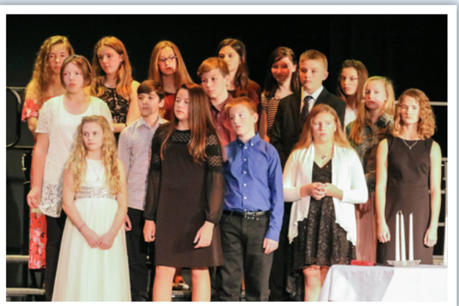
Pictured are the students who were inducted into the Sandy Creek National Junior Honor Society.