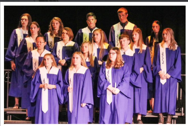
Pictured are the 16 students who were inducted into the Sandy Creek chapter of National Honor Society recently.