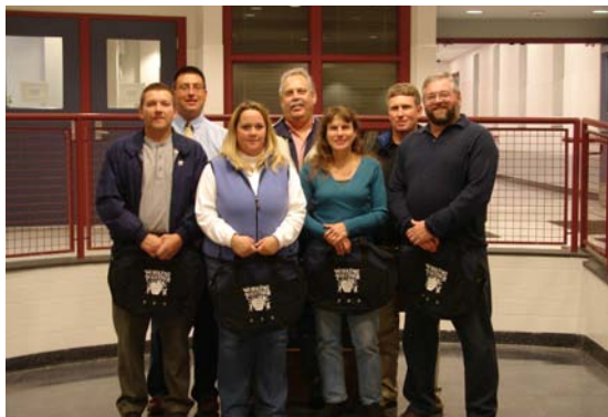
SCCS Board of Education