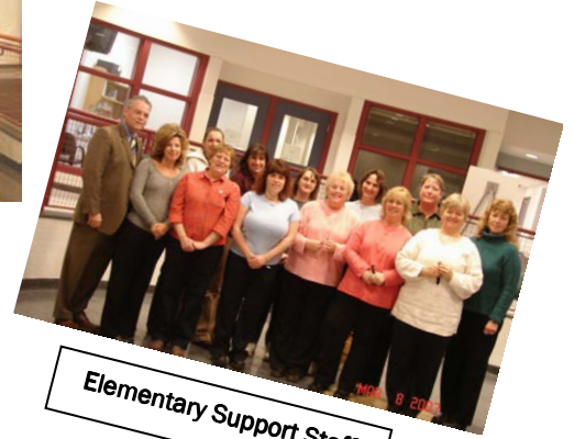
Elementary Support Staff