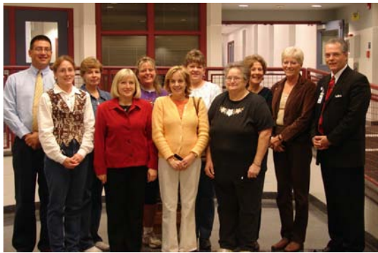
Food Service Staff