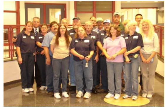
Buildings & Grounds