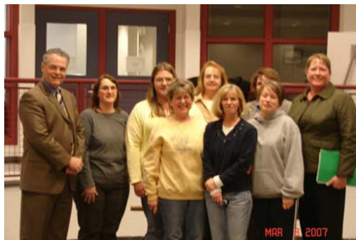
School Bus Aides