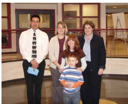
Operation Cargo Pocket