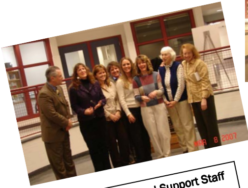
High School Support Staff