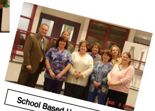
School Based Health Center