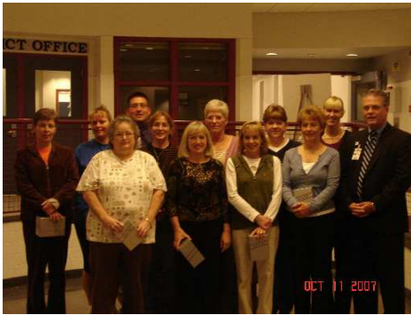
Food Service Staff