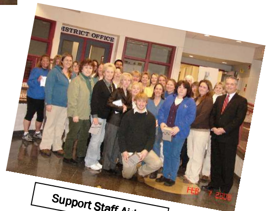
Support Staff Aides