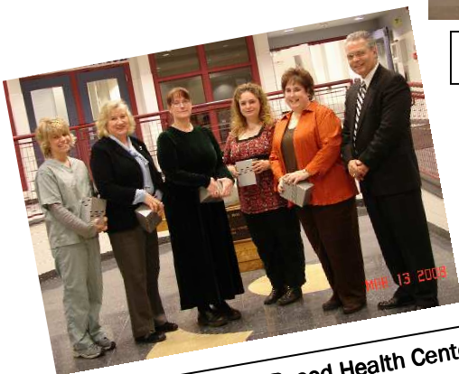
Nurses & School Based Health Center