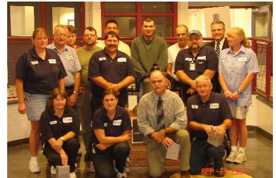
Buildings & Grounds