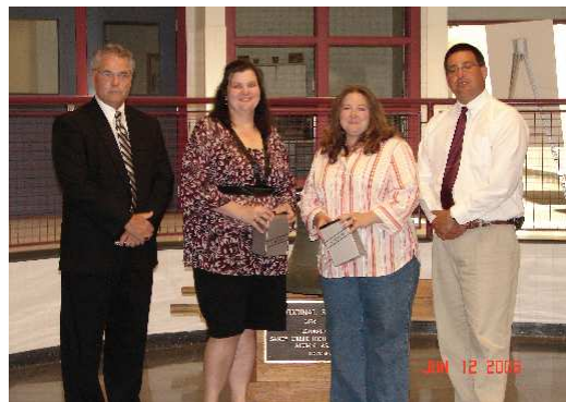
CSE / CPSE Parent Volunteers