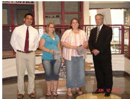
Business Club Board Prep