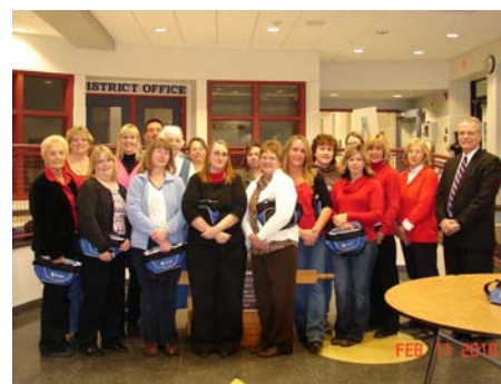
Support Staff Aides