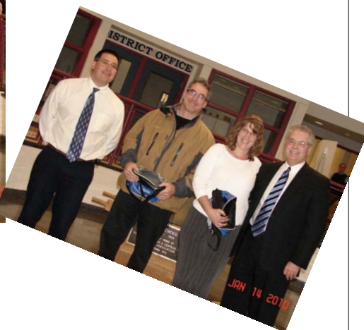
Administration, Coordinators and Teacher Assistants