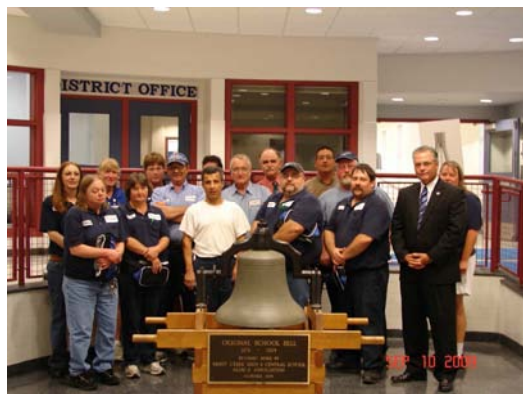
Maintenance & Operations