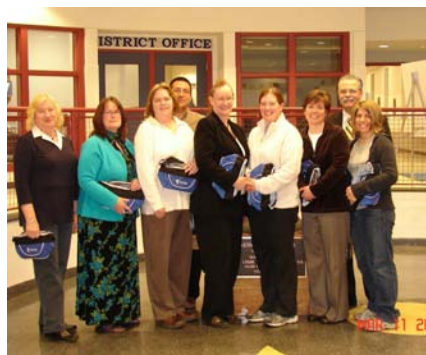
Nurses & School Based Health Center