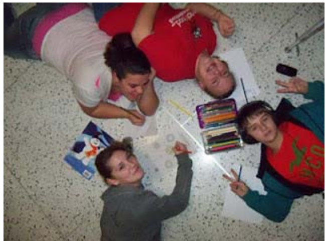
Students worked hard on cards to say thank you to bus drivers, nurses, custodians, maintenance staff and office ladies.