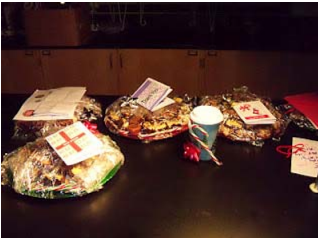
Platters are complete! They looked too good to eat.