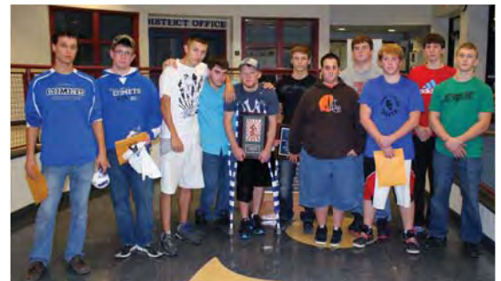
The football team also had 12 members qualify as a Scholar Athlete Team, with a combined average of 91.48.