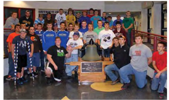
Pictured above, the 2012 Section III Championship Sandy Creek Football Team following the Football Banquet where individual and team awards were handed out.