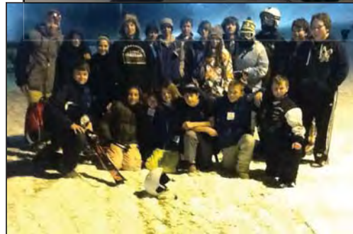
Sandy Creek students participating in Ski Club travel each Thursday to Dry Hill Ski Area in Watertown, NY for several hours of downhill skiing and snowboarding.