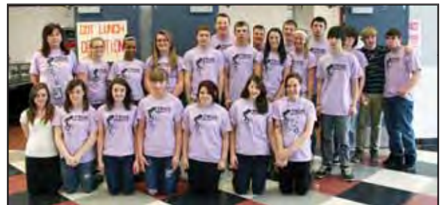
Sign up for the True Beauty service club was held during lunch periods A and B at Sandy Creek High School. Club members wore light purple shirts that proclaimed their "True Beauty" while new members wore "rock star" ribbons created by club members.