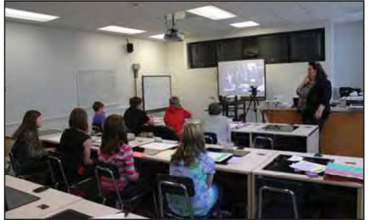
The Distance Learning Program at Oswego County BOCES coordinated the Read Around the Planet project that linked Sandy Creek Middle School with Alberta, Canada.