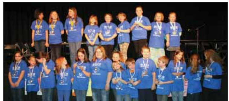
Pictured are the 3rd and 4th grade team participants.