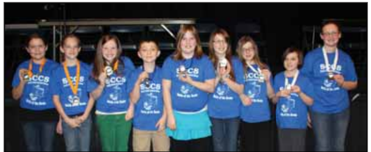
Pictured are the 5th grade gold, silver and bronze teams.