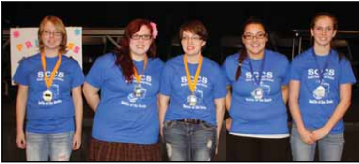
Pictured are the 9th-12th grade gold and silver medal teams.

Students in the Sandy Creek Central School District (SCCS) put their literary knowledge to the test for a chance to be crowned Battle of the Books champion, and represent their district in the county-wide competition to be held May 1st at Altmar-Parish-Williamstown High School.