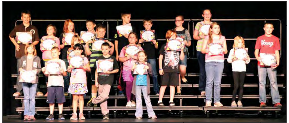
Pictured are students recognized for their excellence in art. The students received their certificates at a special Elementary School Student Council Awards Ceremony.