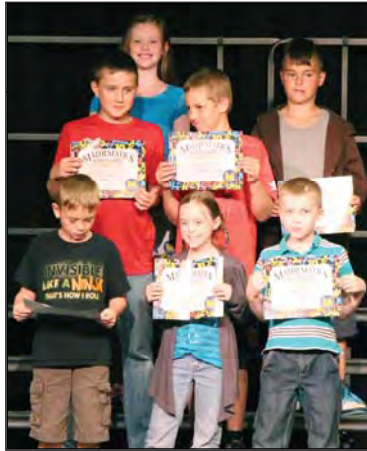
Sandy Creek Elementary School students received special recognition for their academic and special interest achievements during the Student Council Awards Ceremony. Pictured are some of the students who received the math achievement award during the ceremony.