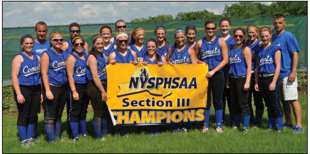
The Sandy Creek Varsity Softball team holds the Section III Championship banner following their win over Weedsport to secure the Class C title.

In post-season play, the team soundly defeated Weedsport 11-0 to secure the Class C-2 Section III title. Next they faced Cooperstown in the overall Class C Championship defeating them with a score of 6-4. The team