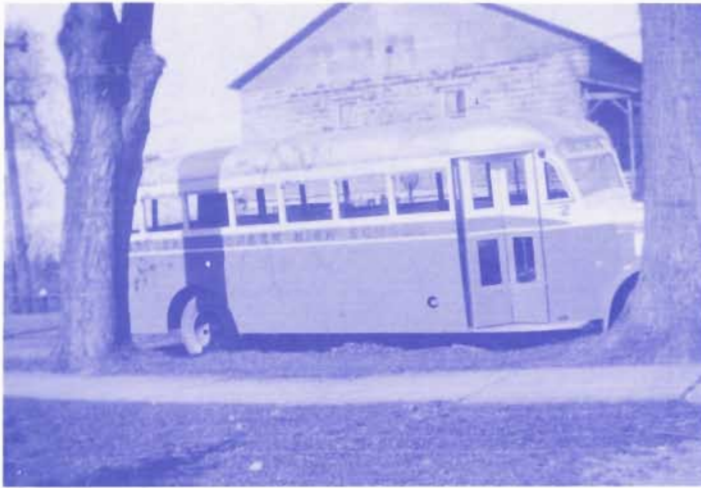
School Bus No. 2, 1935 (Brockway)

The high school bought a second school bus in 1935, a Brockway. Rich Reynolds was the bus driver. The first busses were blue and white. This bus took the place of No. 1 and Bus No. 1 went west of town to the Corners and up Weaver Road to the Goodnough District.