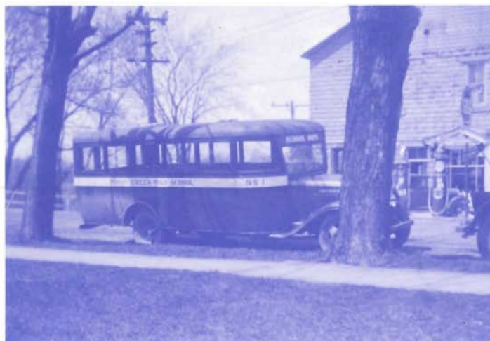
School Bus No. 1, 1932 (GMC)

The one-room school houses were slowly closed and, after 1929, children were transported to the new high school. Most of the school houses were sold and turned into private homes. Some have fallen into disrepair and tumbled down.