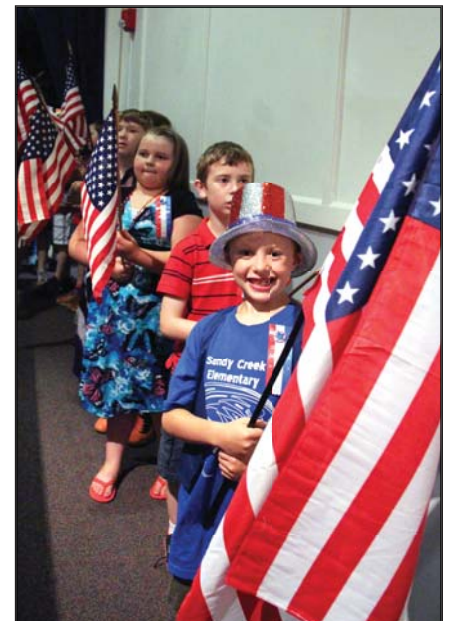
Second grade students at Sandy Creek Elementary School prepare to march into the auditorium in celebration of Flag Day at the school.

Sandy Creek Elementary School second graders showed their love of country and their spirit of patriotism in a Flag Day celebration at the school recently. Dressed in red, white, and blue, the students entered the auditorium each proudly carrying a U.S. flag. The celebration featured students sharing information with the audience regarding rules about the flag, what the Pledge of Allegiance means, and then spelled America with each letter representing another great fact about this country.