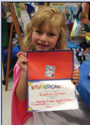
Kindergarten moving up ceremony pictures on page 4.