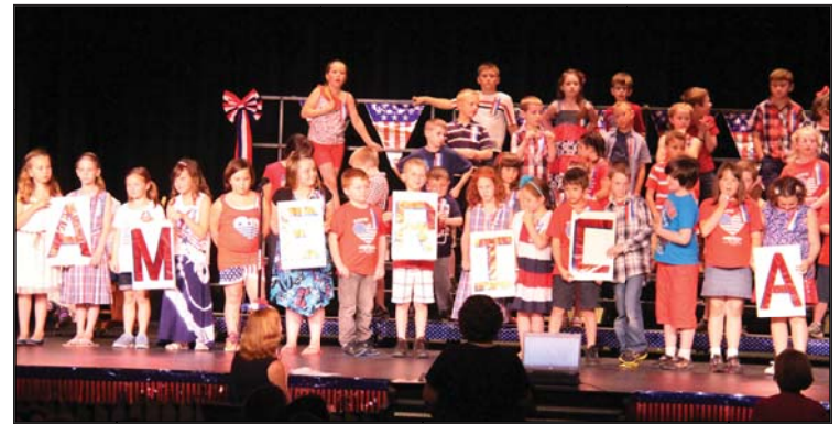
Flag Day celebrations at Sandy Creek Elementary School included several patriotic songs.

Sandy Creek Elementary School second graders showed their love of country and their spirit of patriotism in a Flag Day celebration at the school recently. Dressed in red, white, and blue, the students entered the auditorium each proudly carrying a U.S. flag. The celebration featured students sharing information with the audience regarding rules about the flag, what the Pledge of Allegiance means, and then spelled America with each letter representing another great fact about this country.