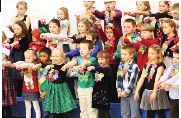
Above: Sandy Creek first-graders wish "You!" a Merry Christmas at their Holiday Concert.

H oliday Concerts filled the air with music as Sandy Creek's talented students from all grade levels performed band and chorus concerts for family and friends. Audiences packed the auditorium and gymnasium for the chance to listen to the student holiday showcases.