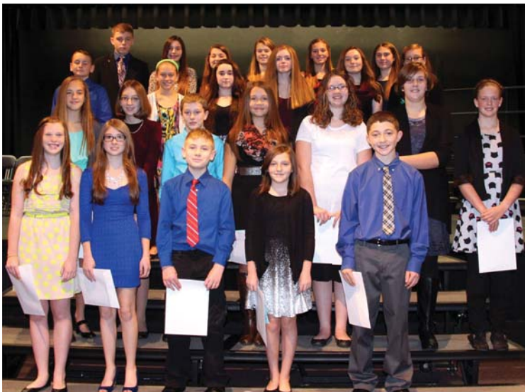
Sandy Creek Middle School National Junior Honor Society members are pictured following the induction ceremony of new members.