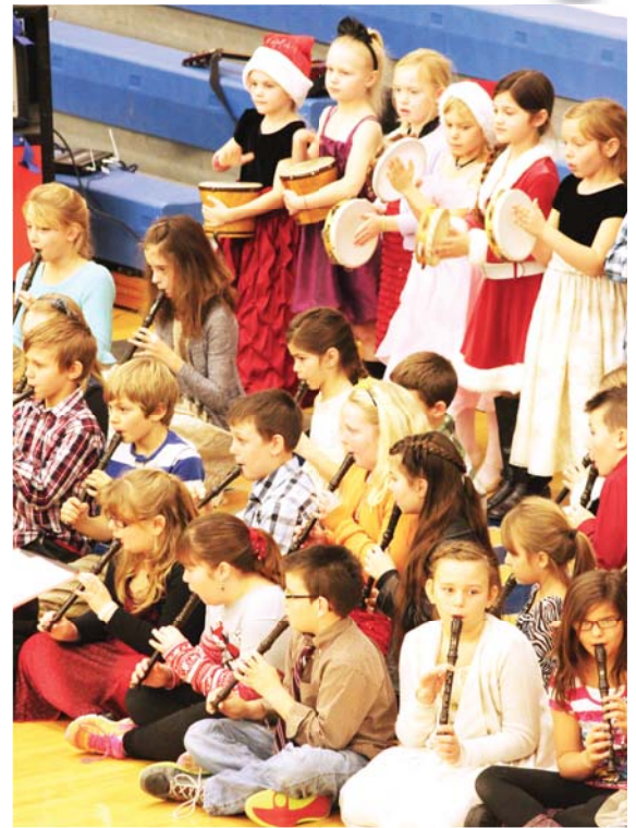
Above: Sandy Creek Elementary students showcase their musical talents both vocally and instrumentally at the Holiday Concert.