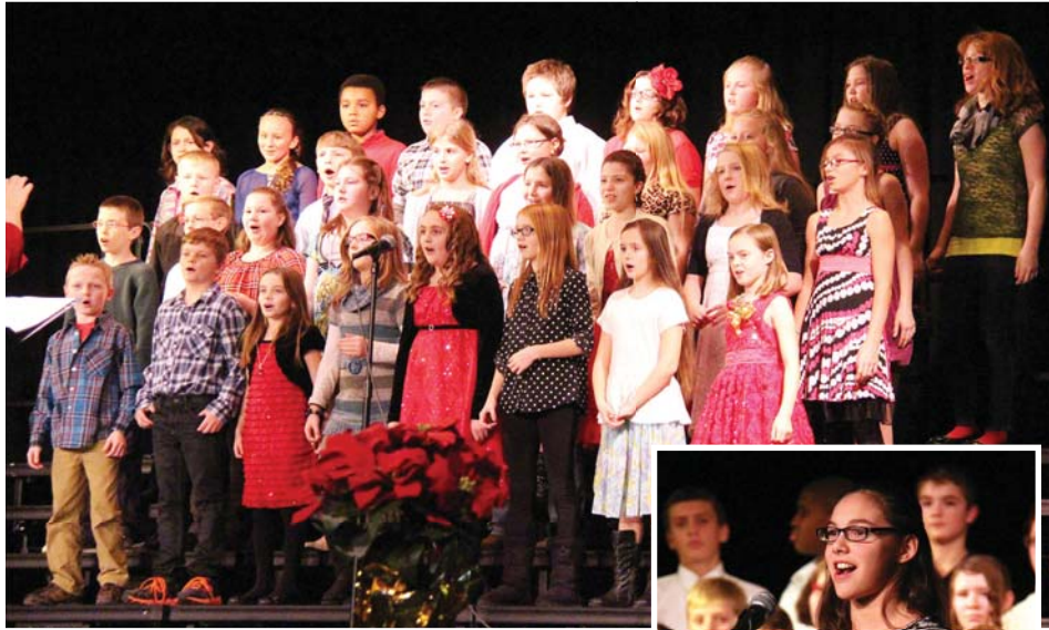
Above: Fifth grade chorus delighted the audience with their song tributes to snow.