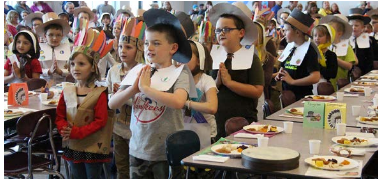
Traditional songs of Native Americans, Thanksgiving and harvest time were sung by students in grades one and two at Sandy Creek Elementary School.