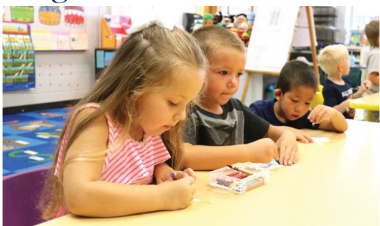
Pre-kindergarten students color a birthday cake to place on a display in the classroom highlighting their birthday dates.

Pre-Kindergarten students had many "firsts" on their first day of school in the Sandy Creek Central School District recently. For many, it was their first bus ride; they made new friends; toured the building; and learned "criss-cross applesauce, spoons in the bowl" is the safe way of sitting on the rug; among many other "firsts" for this school year.