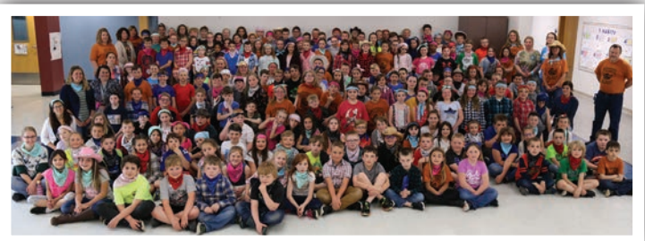
Grade 3-5 students show their support, raising money for the fight against cancer with Creekers for the Cure!