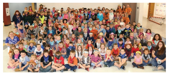
Students and staff in grades K-2 gathered for a group photo in support of Relay for Life as they gave cancer the boot in this year's cowboy-themed campaign.