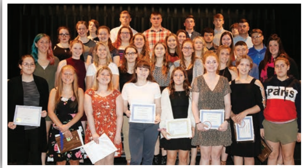
Students receiving awards and honors at the high school awards ceremony.