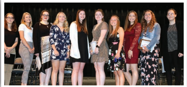
The Top 10 seniors in the class of 2019.